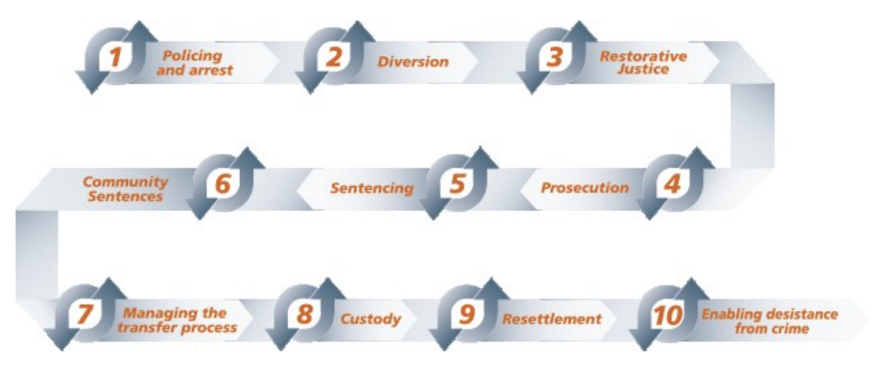
Figure 1.1 T2A Pathway Model

As part of the T2A programme, three pilot projects were selected to demonstrate new ways of involving the voluntary sector in supporting young adults under supervision by probation services. The projects ran between 2009 and 2013, working with more than 1000 young adults and demonstrated innovative approaches to reducing reoffending, addressing breach rates and improving social outcomes. Building on the learning from the three T2A pilot projects, the T2A Alliance developed a new programme, the T2A Pathway Programme. The T2A Pathway Programme was launched in January 2014 to test innovative ways of working with young adults at the key points of the criminal justice system - the T2A Pathway Model (illustrated in Figure 1.1. below).